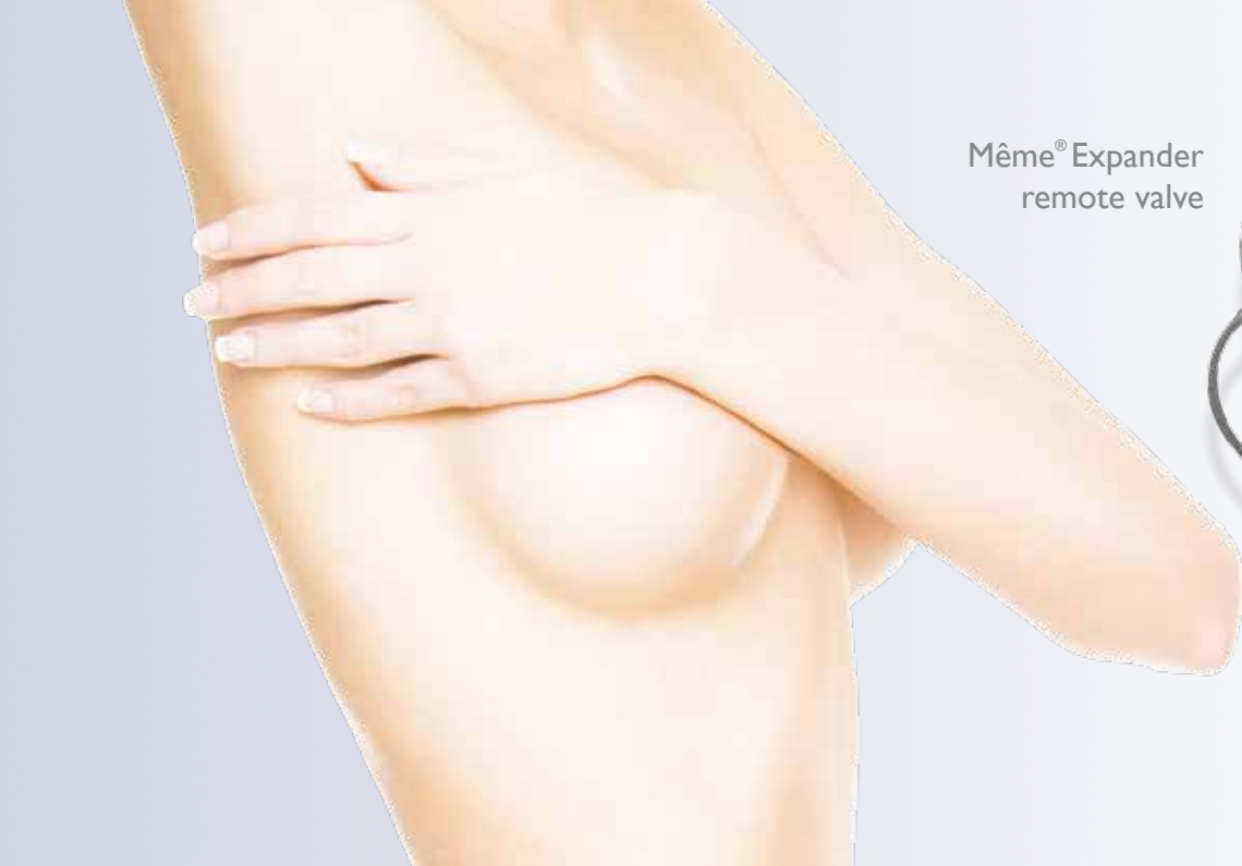
Même® Expander remote valve